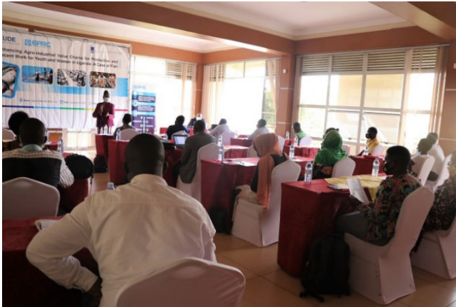
Plate 1: Baraza participants engaging in fish value chains discussions