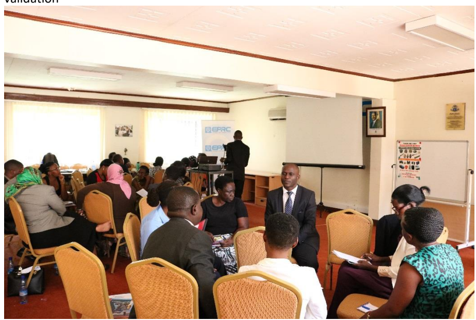
Plate 6: Participants in group sessions on entrepreneurship stakeholder mapping validation

Source: EPRC Archives, EPRC Conference Room, December 20, 2016