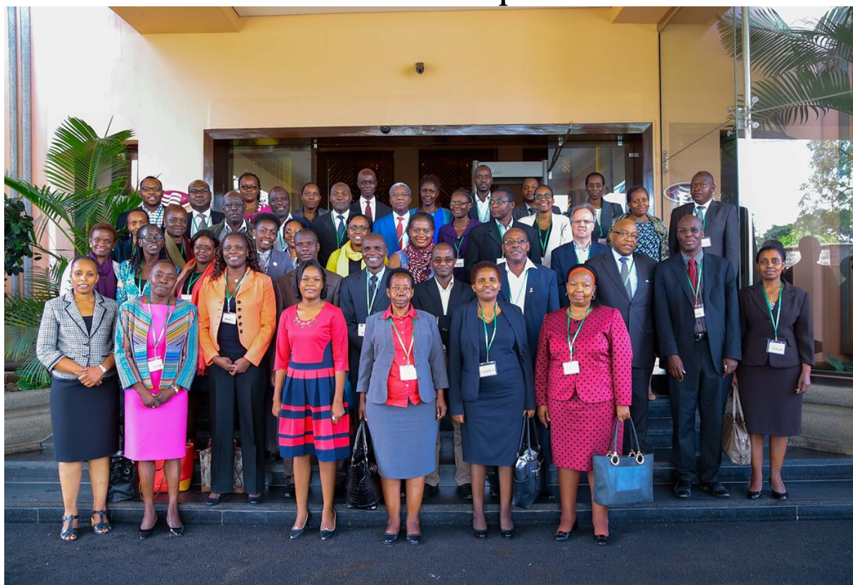
Members of the Community of Practice May 10, 2016 at Crowne Plaza Hotel, Nairobi, Kenya