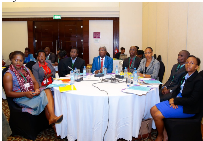
Some participants at the Forum