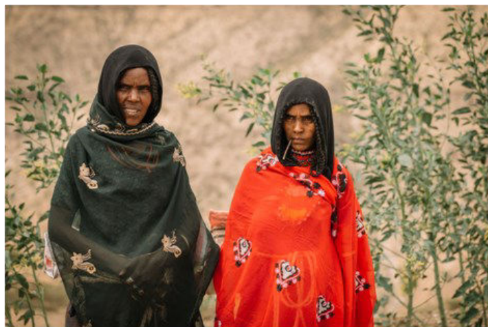
Afar women, Afar region Ethiopia, Jeff Salzer/PENHA 2016

3) Gender and youth; 4) Village institutions; 5) Seasonal calendar and trend lines; 6) Wealth ranking, problem analysis, and community action plans.