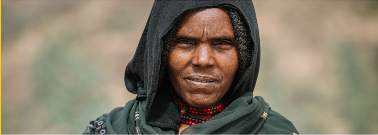
Afar Woman, Afar Region, Ethiopia