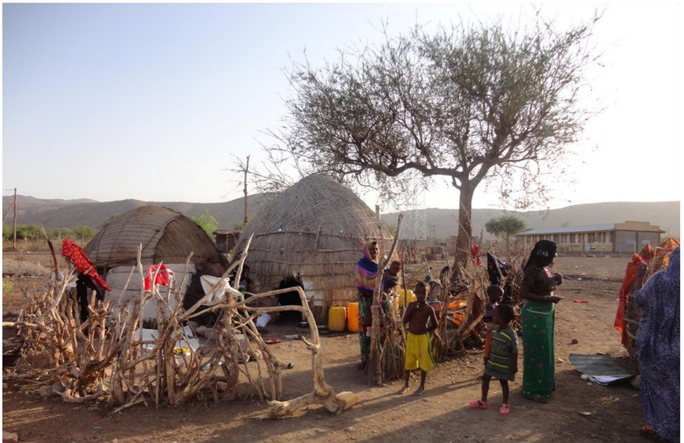
Afar family members near their traditional hat, Anderkelo (Chifra), Afar region, Ethiopia, Bereket Tsegay PENHA 2016.

One household is assumed to comprise a maximum of five persons, regardless of the total number of family members. Furthermore, the supply of conservation tools and equipment is not matched with the demand of the public work participants. In the Afar Region, the PSNP only provides food to support related asset-building interventions. It is not tailored to the production and livelihood system of the people and does not consider the environmental condition of the villages.