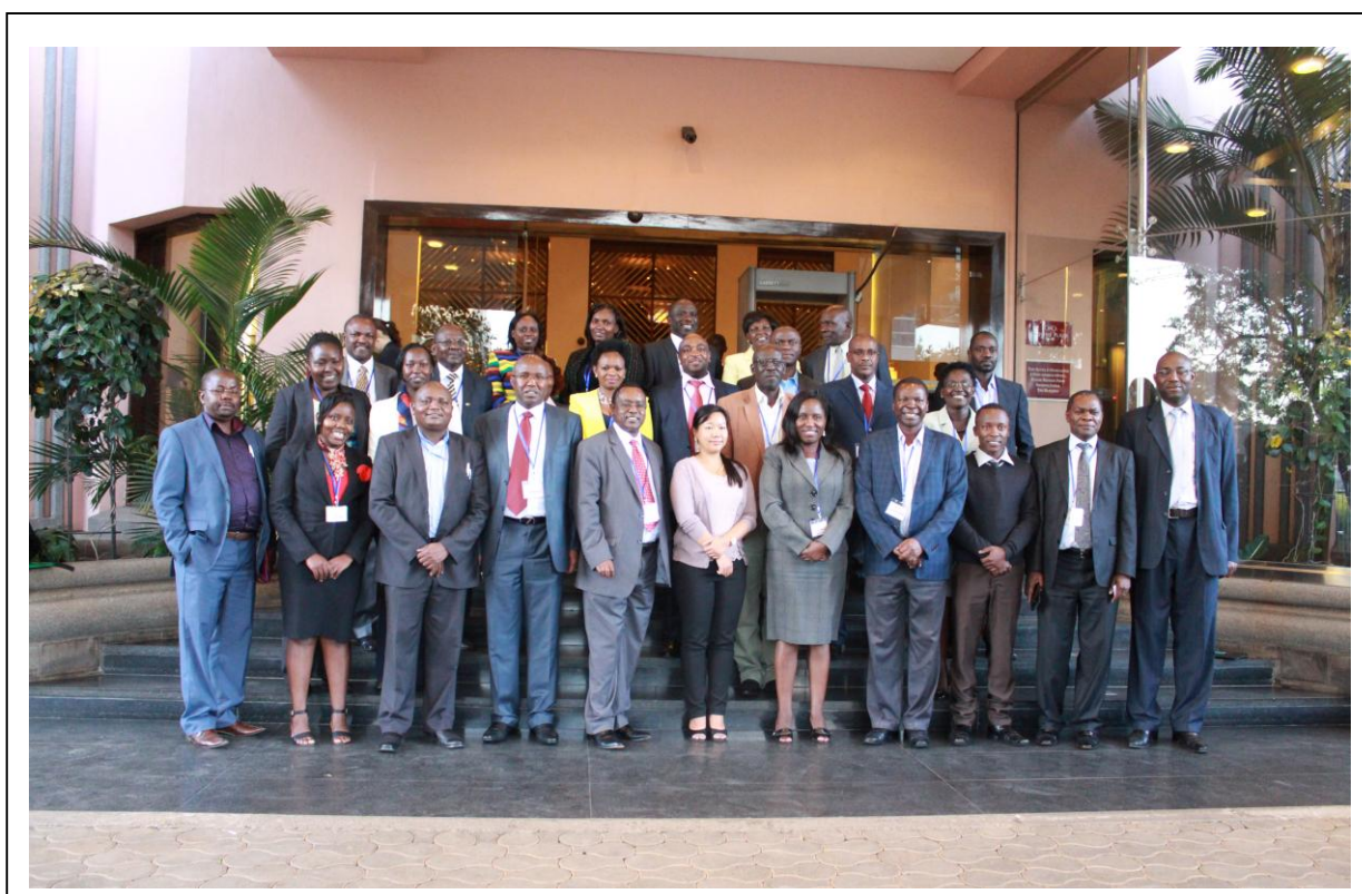
CROWNE PLAZA HOTEL, NAIROBI