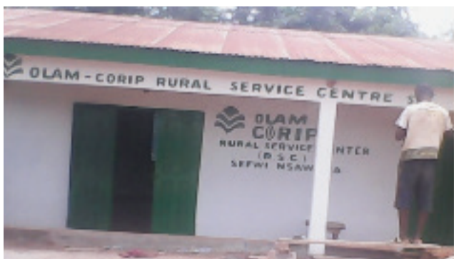
Source: Rural Service Centre (RSC) established by OLAM Ghana under CORIP in Sefwi

Partnerships have improved decision-making processes within Ghana's cocoa value chain. Though top-down in nature, private companies take more lead in the provision of inputs and incentives to farmers located within their areas of operation. As (international) companies actively participate in decision-making processes, their needs were also better served. Smallholder farmers however continue to have limited negotiation power, and mostly rely on LBCs, purchasing clerks and field extension officers to relay their concerns to higher authorities.