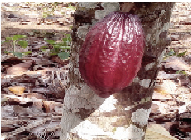
Source: CORIP Cocoa pod at demonstration farm; Kuffour Camp, Bibiani District

The growing importance of global value chains has gained attention of policy makers, international organizations, as well as consumers. While policy makers have been challenged to enact and implement regulations that can ensure food safety and food security along agro-food chains, the monitoring and implementation of such policy efforts often go beyond the scope of local governments. Moreover, there is pressure on governments, industry players, and business communities to include primary producers and haulers of raw materials (mostly smallholder farmers) in decision-making processes. International donors, NGOs and related pressure groups are increasingly calling for inclusive value chain partnerships in agro-food commodities, especially in developing economies.