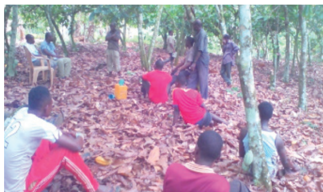
Source: Focus Group Discussion with smallholder cocoa farmers at Sefwi

The sustainability of on-going or completed partnership arrangements among international stakeholders such as World Cocoa Foundation, International Cocoa Organization (ICCO), Fairtrade International, International Labor Organization (ILO), United Nations (UN), Cadbury International, CARGILL, etc. are also questioned because of the challenges encountered when implementing exit strategies to end the partnership. There have further been some overlaps and repetition on the core mission of most of these partnership initiatives as well. Local ownership, especially by LBCs of many cocoa related partnership arrangements has been limited at the time of this study.